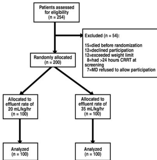
Figure 1. Trial profile.